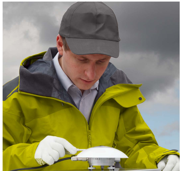
Figure 3 IR20 pyrheliometer being prepared for application.