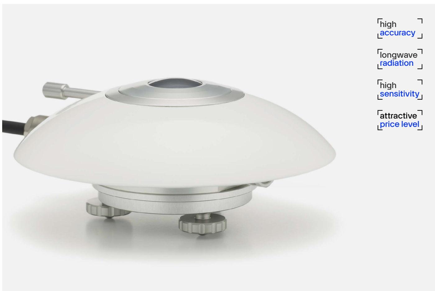
Figure 1 IR20 research-grade pyrgeometer.

Model IR20WS has a wide spectral range with a cut-on at 1.0 \times 10^{-6} m. It offers superior accuracy during nighttime, when solar radiation is absent.